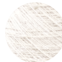
Ec001 Aegean ecru 1 100% Aegean