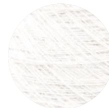
Ec002 Egyptian cream 100% Giza 95