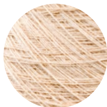
Br102 | Light Brown 2 30% BRS Rubi 70% Branco Mocó