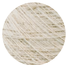
Gr108 | Pale green 15% BRS Verde 85% Branco Mocó