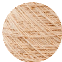
Br103 | Dark brown 50% BRS Rubi 50% Branco Mocó