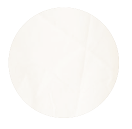
Wh001 Egiptian white 100% Giza 92 (OCCBiodynamic Egypt)