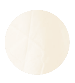
Ec002 Egiptian cream 100% Giza 95 (OCCBiodynamic Egypt)