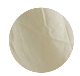
Gr104 Pastel green 2 15% BRS Verde / 85% Branco Mocó (OCCRegenerative Brazil)