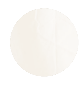
Ec001 Aegean ecru 1 100% Aegean (OCCRegenerative Turkey)