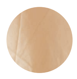
Br102 Pastel brown 2 30% BRS Rubí / 70% Branco Mocó (OCCRegenerative Brazil)