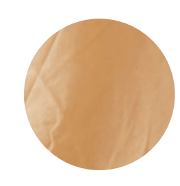
Br103 Red brown 15% BRS Rubí / 85% Branco Mocó (OCCRegenerative Brazil)